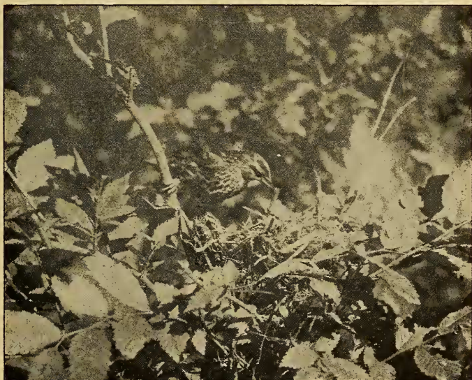
The Attitude of Inspection.

was from 15 to 20 feet from the edge of the water. Beginning at the water's edge and going towards the nest we found several more or less well defined areas of growth: first, in the edge of the water was a dense growth of arrow-head lilies ( Sagittaria sp? ) in a strip of six or eight feet in width; second, from three to five feet inland was a region of bare earth or a short growth of a sedge of an unknown species; third, a band of smartweed ( Polygonum sp? ); and lastly, a mixed